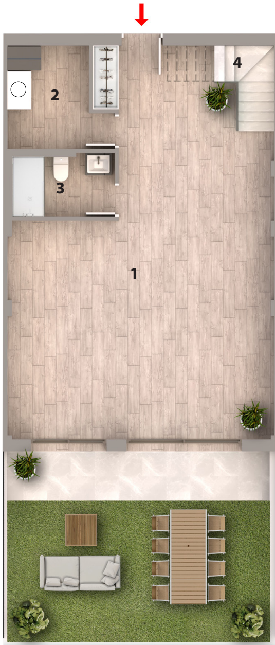
Planta Bajo Rasante